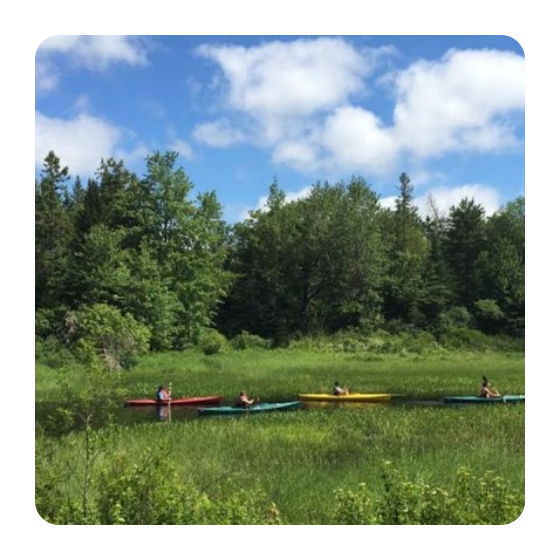
The Activity Shop