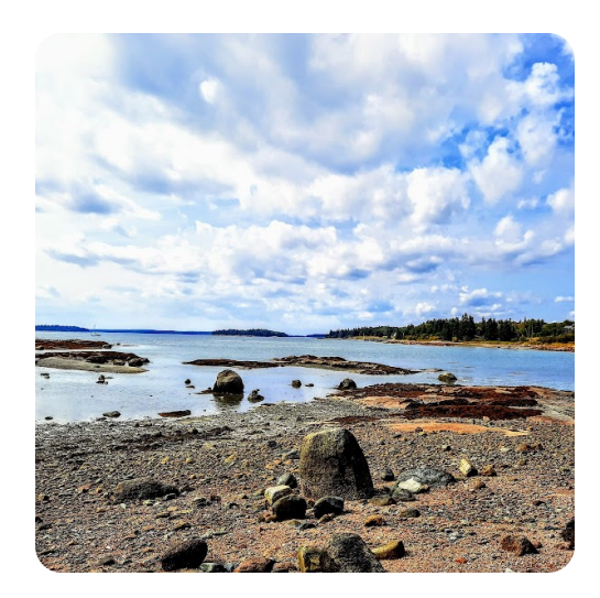
Roaring Lion Farm